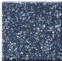
north sea 520