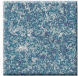
light blue 501