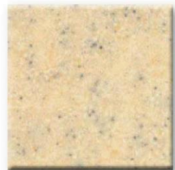
beach sand 103